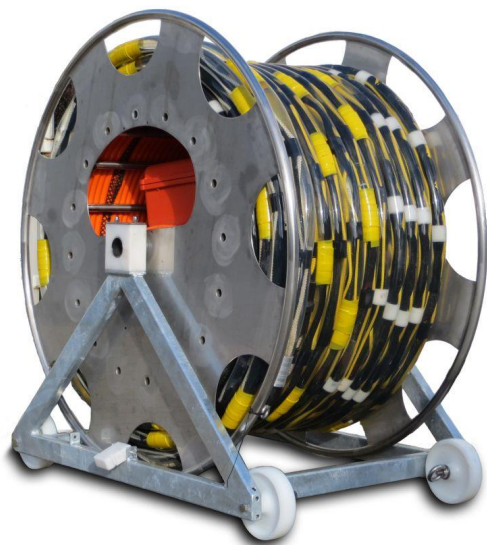
Electrical winch with a 48 multi-channel streamer

Each MultiTrace module comes with a 3-year guarantee for any hardware breakdown, which is not due to an operator error, over voltage or obvious negligence.