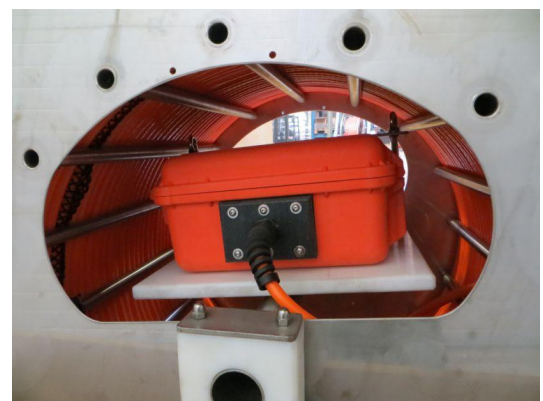
Multi-trace rests inside the water-tight pelicase inside the winch drum