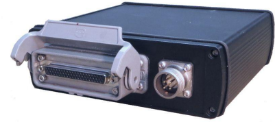
Rear view - 24-channel and 4-pin inputs.