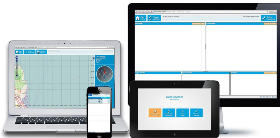
GeoRecorder Acquisition Server

Real-time navigation annotation on screen is standard, dedicated window for real time track plot, navigation editing, smoothing, speed correction etc.